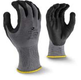
Radians RWG13 Foam Nitrile Gripper Glove