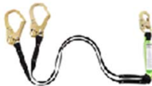
Shock Absorbing Lanyards