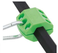
Peakworks Press Block