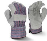
Radians RWG3111 Economy Shoulder Gray Split Leather Glove