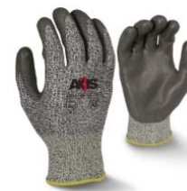
Radians RWG530 AXIS™ Cut Protection Level A2 Work Glove