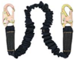
V0102506 Welder's Shock Absorbing Lanyard