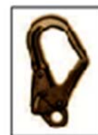
Form Hook 2 1/2" (64 mm) Gate Opening