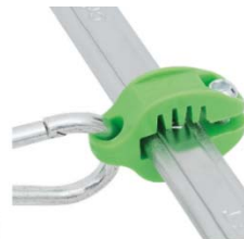
Peakworks Flat Clamp