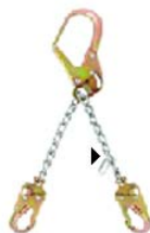
Rebar Chain Assembly