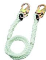
Restraint Lanyard with 5/8" (16 mm) Rope