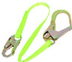
Restraint Lanyard with 1" (25 mm) Webbing