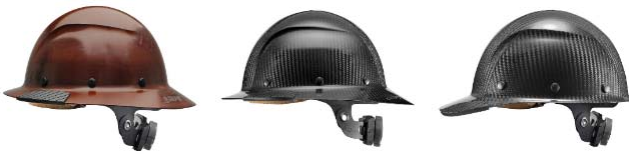
DAX FULL BRIM HARD HAT