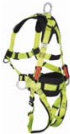
PeakPro Plus Series