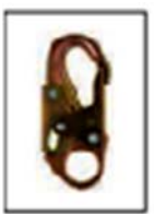
Snap Hook 3/4" (19 mm) Gate Opening