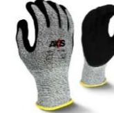
Radians RWG534 AXIS™ Cut Protection Level A2 Micro Sandy Foam Nitrile Coated Glove