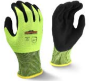
Radians RWG10 Radwear® Silver Series™ High Visibility Knit Dip Glove