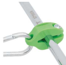
Peakworks Round Clamp