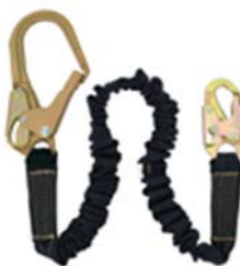
V8109526 Welder's Shock Absorbing Lanyard