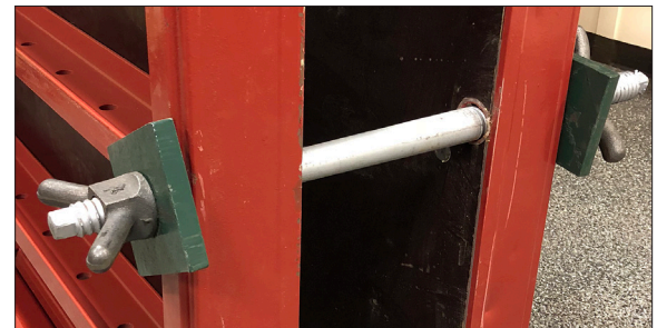
An assembly consists of the Taper Tie, two Flat Washers, and two Wing Nuts.