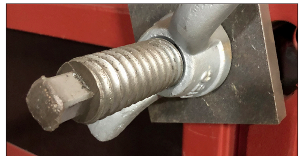
Hitting Taper Ties on the squared end will avoid thread damage and stripping difficulty.