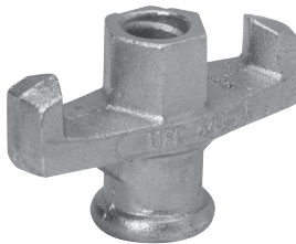
Euro Wing Nut