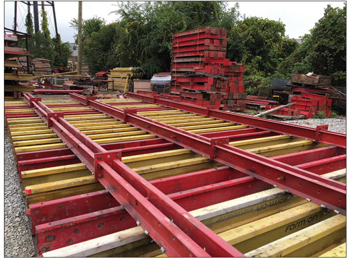
Butt Plate Walers, bolted together end-to-end, are used to support this large wood beam gang.

The Double Channel Waler is another common waler design. Double 5" steel channels have 13/16" holes for 3/4" bolts, spaced on 6" centers, for waler attachment hardware. The steel channels are positioned back-to-back and separated by a 3" gusset or sleeve. (See following page for sizes)