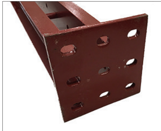
Butt Plate Walers have 1/2"x9"x9" end plates with slotted holes for end-to-end connections.