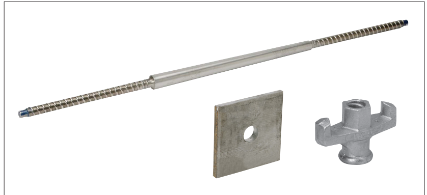
The Euro Taper Tie, two Flat Washers and two Wing Nuts provide a removable and reusable gangform tie system.

Euro Taper Ties have flats at the larger end, allowing the tie to be turned with a wrench during stripping. A hammer is used to strike the tie on the smaller end for removal from the gangform and wall.